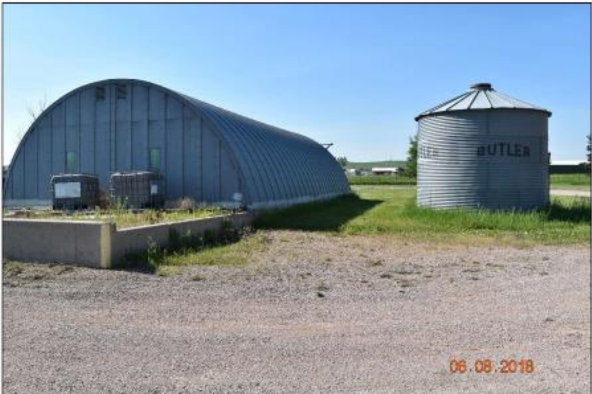
Subject- View of Quonset and Grain Bin (Personal Property)- North and West Elevations