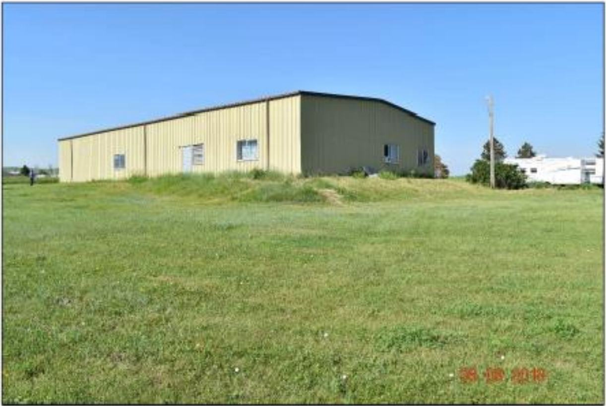
Subject- Light Industrial Building- View of North and East Elevations